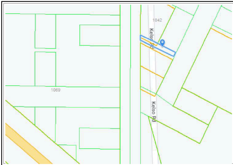
Laneway north of Lot 39